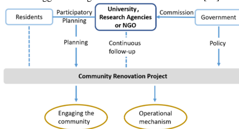
Figure 3. Social force-led community regeneration operationa

Some residents' groups can also lead the community small-scale renewal projects by establishing "self-organisation". A residents' self-governing organisation, such as the self-governing group for parking lots shortage in Xinhepu Community, in Guangzhou, and the "Xinhepu Road Section Mutual Aid Association" [25], which evolved from it. In Nanjing, the "Cui Zhu Yuan Mutual Aid Association" [26]. was established in the Cui Zhu Yuan community. Self-organisations are based on local culture or a solid social network of residents, and their foundation makes them more conducive to the social and emotional benefits of small-scale renewal, allowing residents to grow in their sense of identity and belonging to the community. However, due to the lack of effective guidance and support, self-organisation is often prone to long-lasting difficulties coordinating interests and development. The specific catalytic events that trigger self-organisation make it irreducible [26].